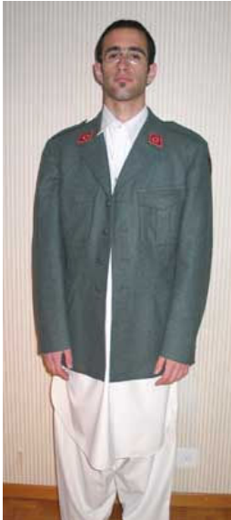
Swiss Army Woollen Long Coat and Dress Coat