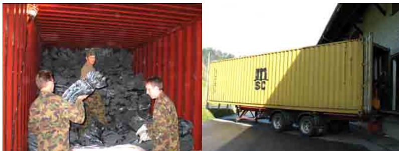
Containers being loaded with Swiss Army woollen coats