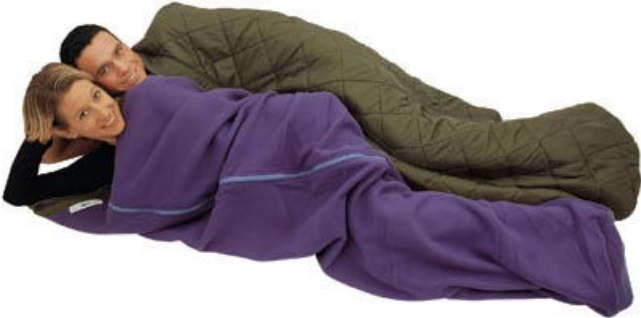
Swiss Army Sleeping bags, thermo & fleece