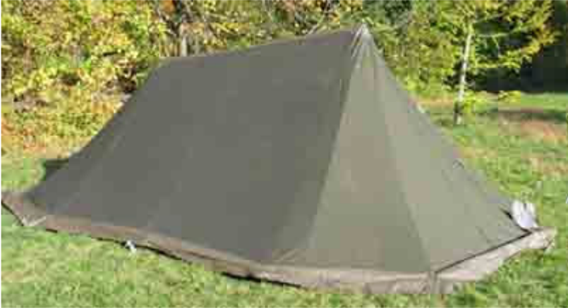
Swiss Army winter tent for 3 person

Images of the material sent to Pakistan by the Swiss Pakistan Society