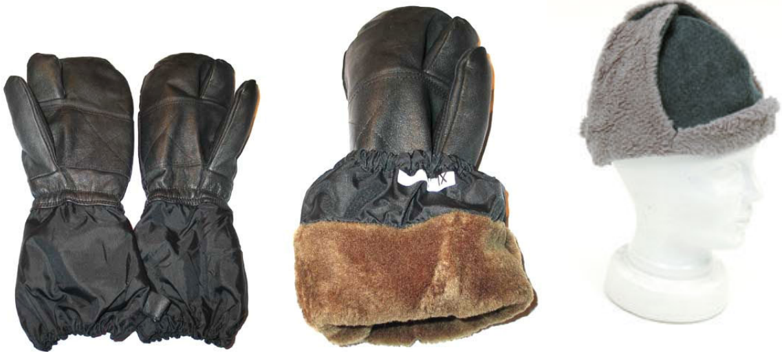
Swiss Army gloves and winter cap for (NVM)