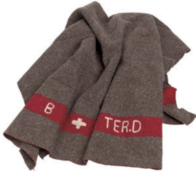
Swiss Army wool Blanket