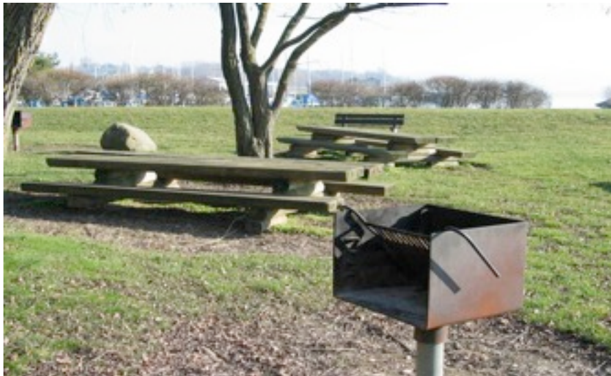
Grills, tables and benches