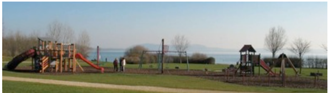
Nearby Play Ground